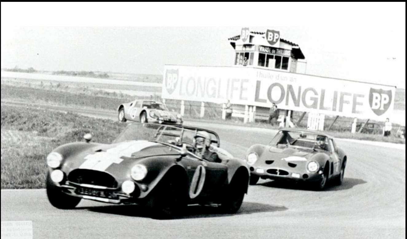
4 e RALLYE DE L'A.G.A.C.I. 1965 - Ep. de Reims

The unique hardtop, essential for top speed on the longer courses, proved to be a distinct disadvantage on the shorter tracks so it was removed. The full-width roll bar was retained. CSX2001 was very successful as a roadster, finishing in First Place in the Rallye de l'A.G.A.C.I. in Reims, and in the Course de Cote in D'Hebecrevon, La Pommerate and Des Andelys.