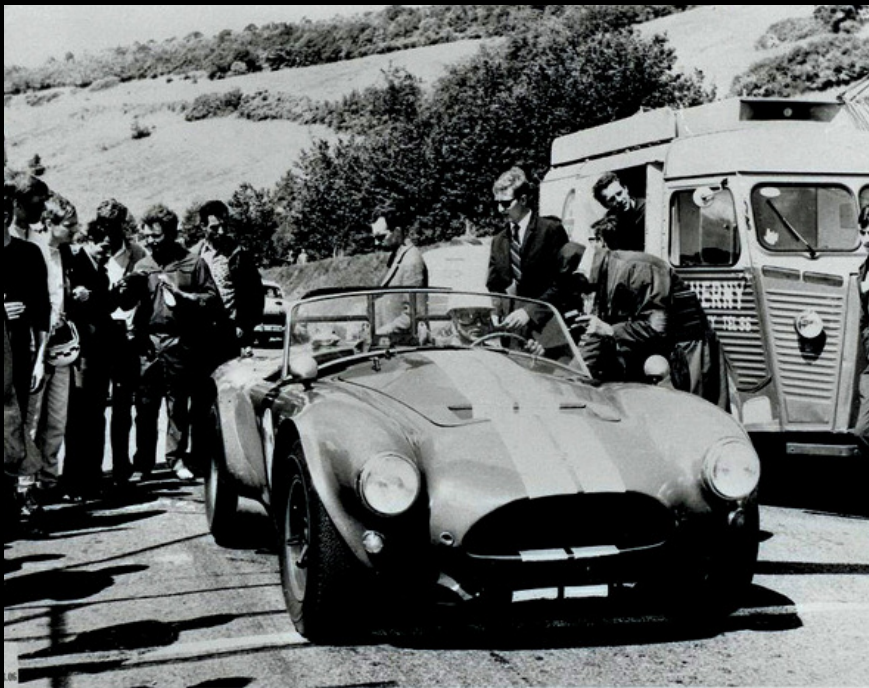
COURSE DE COTE DES ANDELYS 1965

The unique hardtop, essential for top speed on the longer courses, proved to be a distinct disadvantage on the shorter tracks so it was removed. The full-width roll bar was retained. CSX2001 was very successful as a roadster, finishing in First Place in the Rallye de l'A.G.A.C.I. in Reims, and in the Course de Cote in D'Hebecrevon, La Pommerate and Des Andelys.